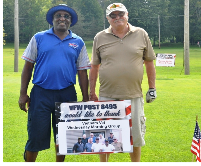
Above and Right: Golfers golfing for a good cause.

Every summer, 8495 members take Veterans for fishing or boating trips, and provide them with an enjoyable day on the water. The Auxiliary from Perinton Post 8495 even helps every year with donations dedicated to help pay for the gas. A true family effort.